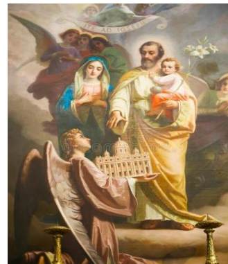
St. Joseph, Protector of the Church, all People of God

In 1870, Blessed Pope Pius IX declared Saint Joseph the Patron of the Universal Church. The Church is universal in two ways. First, the Church is catholic because all baptized people are part of the Church, and the Church possesses the means of salvation. Second, the mission of the Church is universal because the Church has been sent to proclaim Christ to the entire human race. Pope Leo XIII stated that the Virgin Mary is mother of all Christians, since she is Mother of Jesus and gave birth to them on Calvary amid the indescribable sufferings of the Redeemer. Joseph, as her Virgin-Spouse and Patron and Protector of the Church, must regard the multitude of Christians who constitute the universal Church as confided to his care in a special manner as well. As head of the Holy Family, protecting Mary and Jesus, Joseph began his office of protecting the Church, which was in its embryonic state of existence. Joseph was chosen to watch over the source of salvation and of sanctification for humanity. He continues that sacred trust in heaven. In becoming the father and protector of Christ, Joseph was given spiritual charge of all those who would receive the graces of the redemption, just as Mary became the spiritual Mother of all the redeemed. Reference: https://www.ewtn.com/catholicism/library/st-joseph-a-theological-introduction-5899